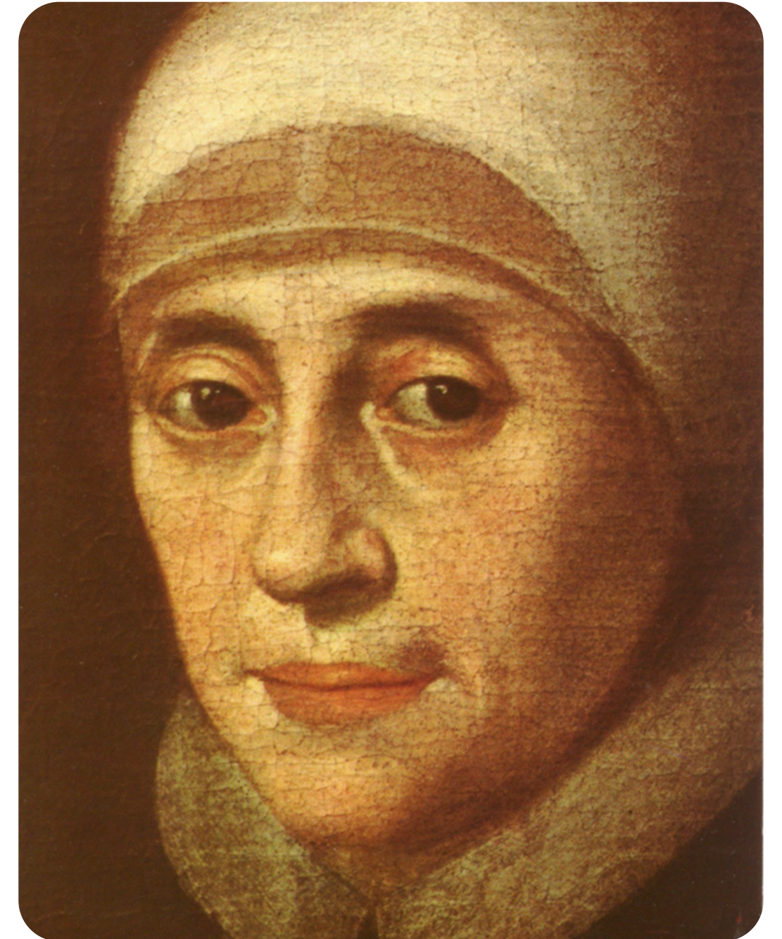
MARY WARD 1585-1645 Founder, Congregation of Jesus

Loreto College was established in 1912 and is managed by the religious order of The Congregation of Jesus . It is a Christian Minority college aided by the Government, committed to providing the highest quality education for women to enable them to develop their intellect and talents and to participate effectively and fully in society. This institution, which is now over a century old, has been awarded 'Heritage' status certified by the KMDA. Loreto College is an affiliated undergraduate college of the University of Calcutta. In 2016, the college received sanction from the University of Calcutta to begin a postgraduate Master's Course in English, and a Master's Course in Psychology has commenced from 2024. Loreto College's vision of holistic education and a commitment to high academic standards has culminated in it being awarded the status of CPE (College with Potential for Excellence) for the 3rd cycle in 2014. It has also been ranked by NIRF (National Institutional Ranking Framework), Ministry of Human Resource Development, Government of India.